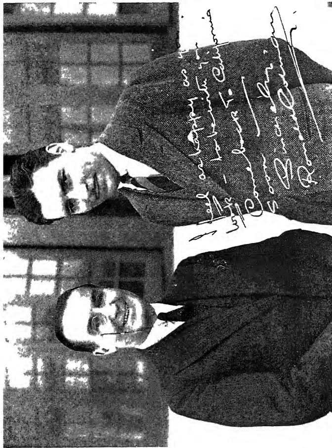
RONALD COLMAN, AN OLD FRIEND, AUTOGRAPHED THIS PICTURE FOR ME BLIORL I LEFT THE FAMOUS FILM CITY